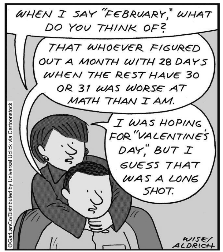
Cartoon Stock - Order #CS116663